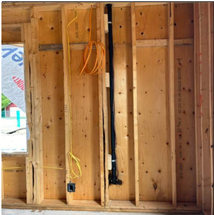
Progress – M&E Rough-in