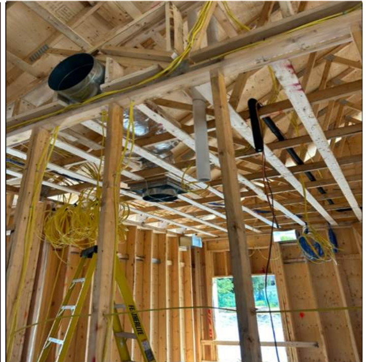
Progress – M&E Rough-in