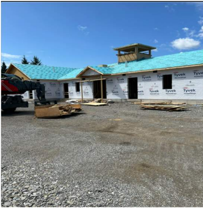
Progress – Exterior weather barriers