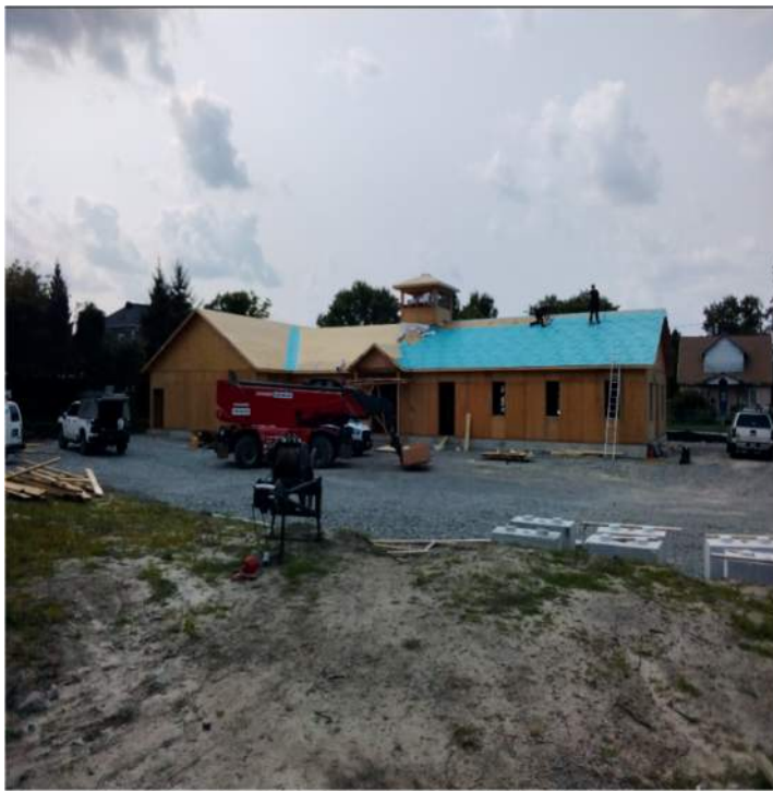
Progress – Structure & Roof Membrane