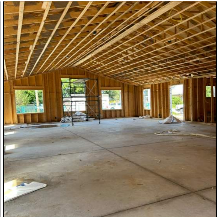
Progress – Wood strapping / rough-ins in Hall