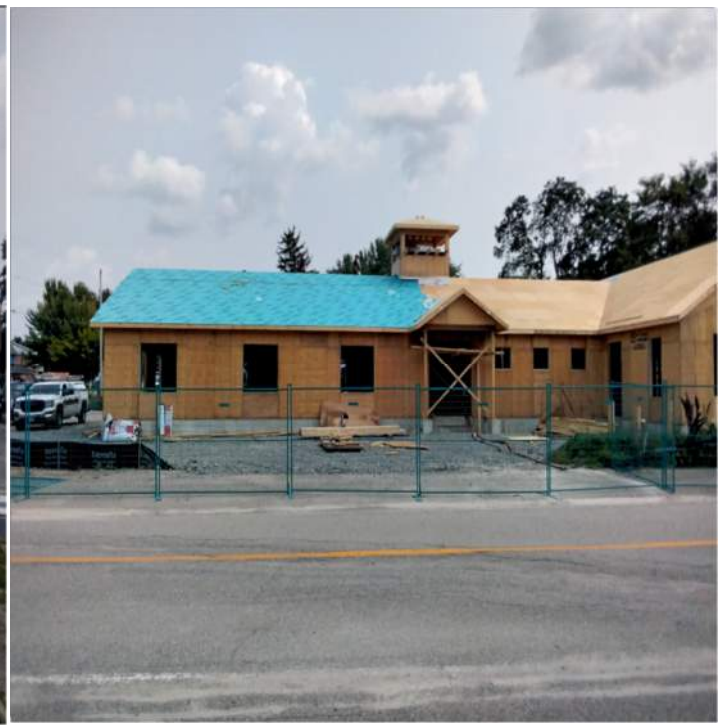
Progress – Structure & Roof Membrane