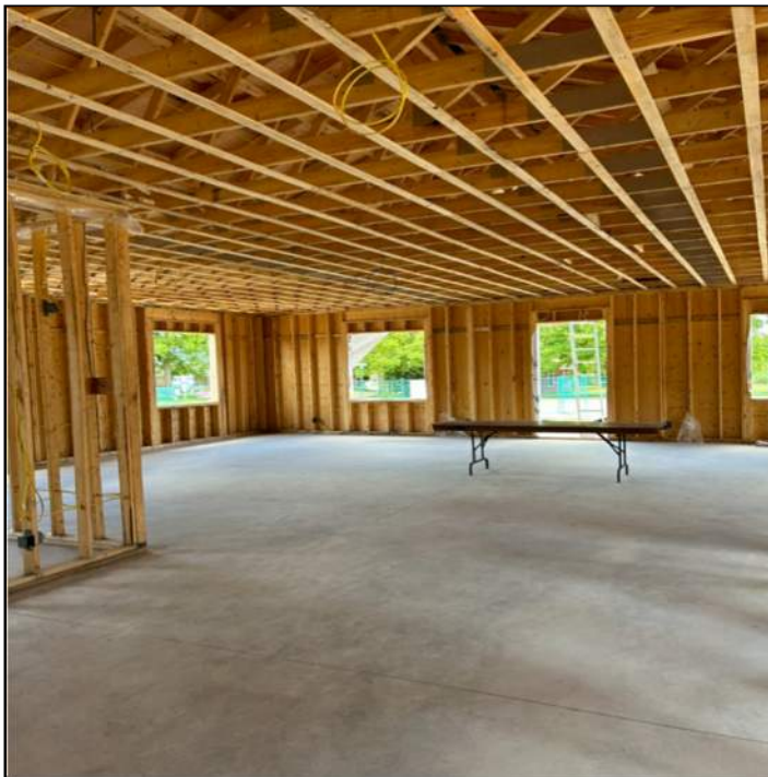
Progress – Wood strapping / rough-ins in Library